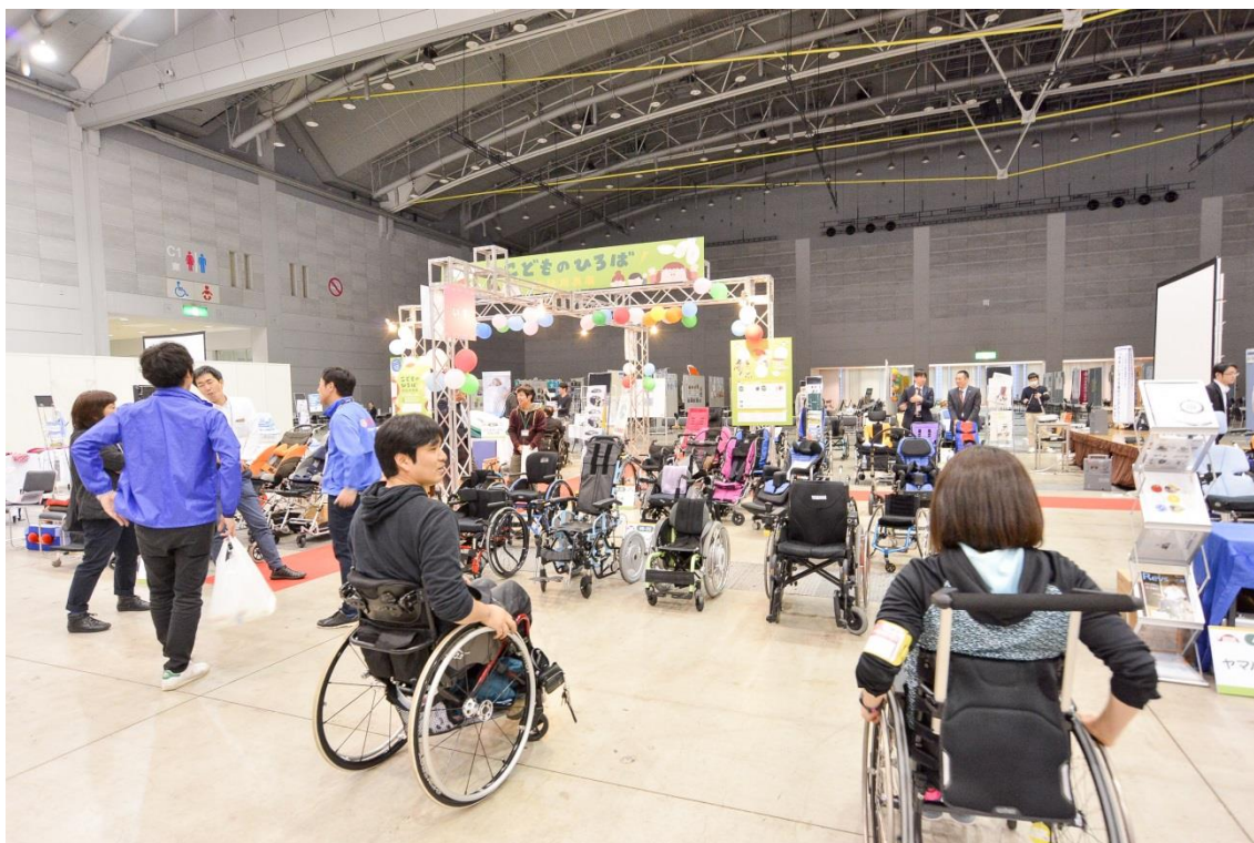
Photos from the most recent fair