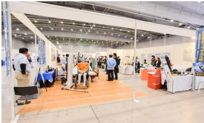
Photos from the most recent fair

Welfare vehicles, wheelchairs, moving equipment, daily necessities, beds, baths/toilets/diapers, communication equipment, building/housing/facility equipment, information/publishing/services, support system for care business operators, care foods, public institutions