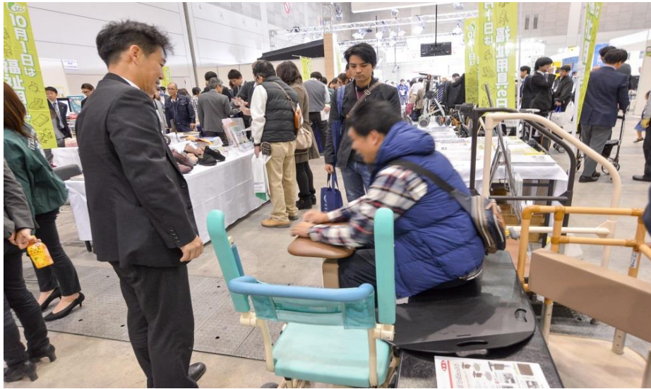
Photos from the most recent fair